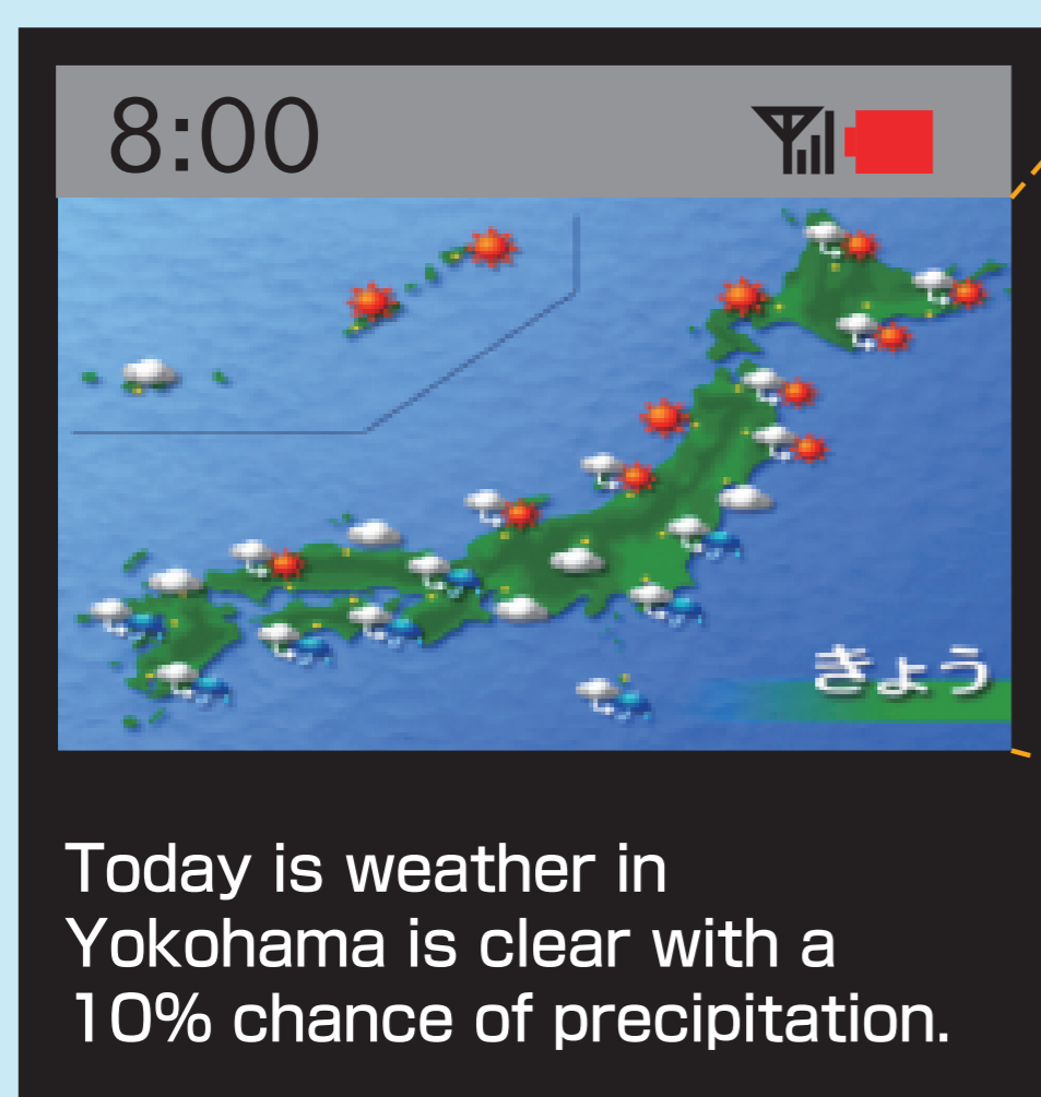
2.4-inch QVGA (vertical)